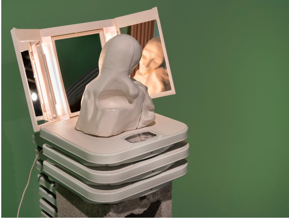
Looks can be deceiving