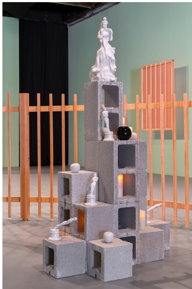
Be brave (installation view), 2019 Porcelain, magic 8 balls, faux candles, cinder blocks 41 x 39.5 x 64.5 inches overall