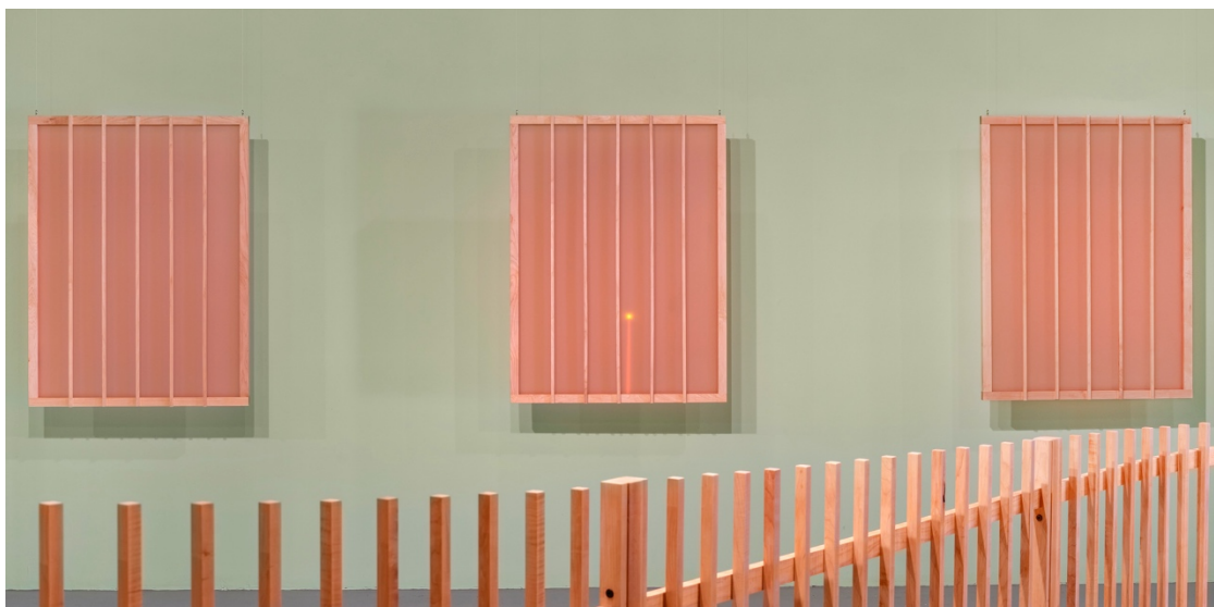
Windows of time I, II, III, IV, V (installation view), 2019

Porcelain, Swiss and French alarm clocks, resin, soil, satin bedding, mattress, faux candles, plastic planter, water, phone cords, fountain pump and tubing 136 x 117 x 31 inches overall