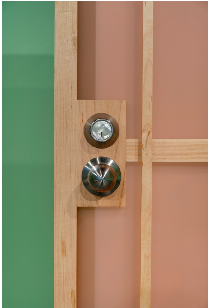
En trance (detail), 2019

Porcelain, Perspex, holy rosary, faux pearl necklace, weight scales, faux candles, cinder blocks 23 x 10.5 x 62 inches overall