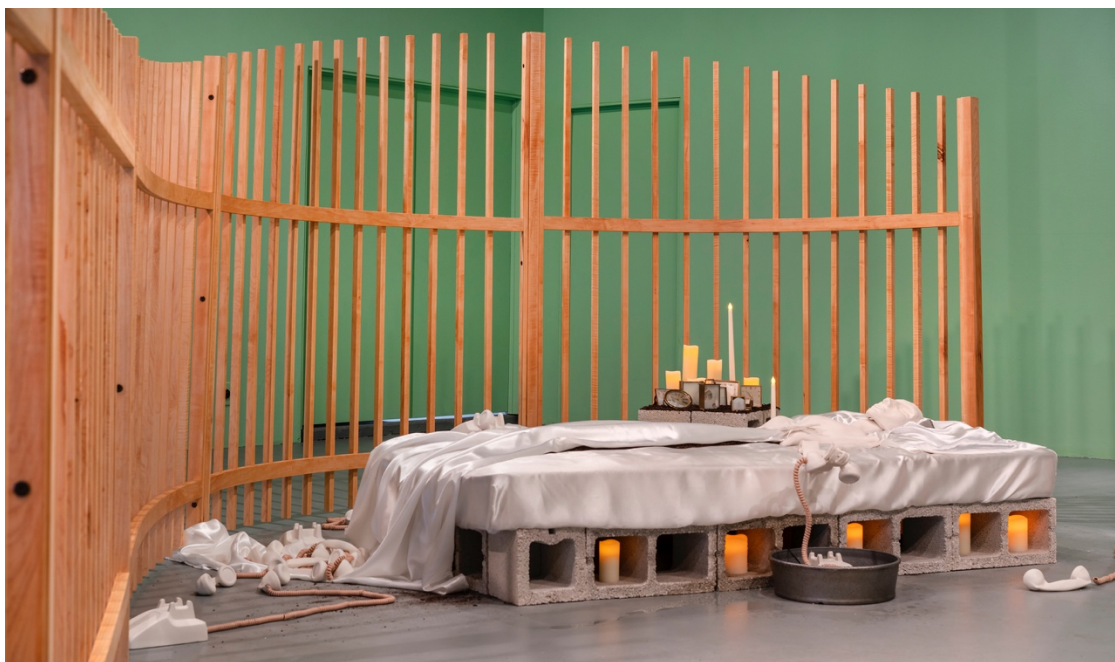
Recurring dream (installation view), 2019

Porcelain, Swiss and French alarm clocks, resin, soil, satin bedding, mattress, faux candles, plastic planter, water, phone cords, fountain pump and tubing 136 x 117 x 31 inches overall