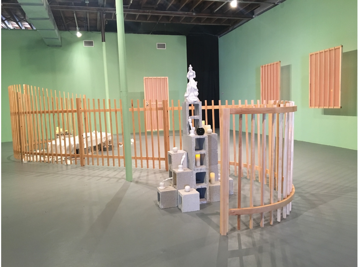
Cristine Brache: Cristine's Secret Garden Installation view at Locust Projects 2019