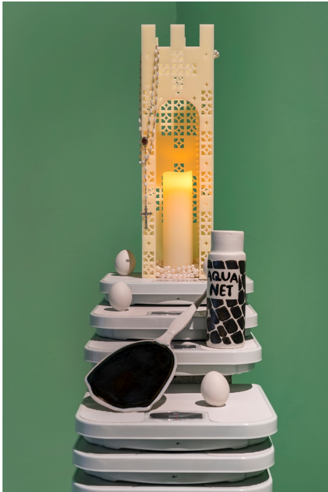
Casa de Santos (detail), 2019

Porcelain, Perspex, holy rosary, faux pearl necklace, weight scales, faux candles, cinder blocks 23 x 10.5 x 62 inches overall