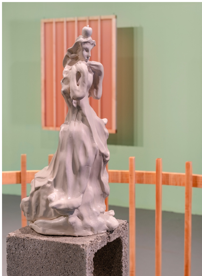
Be brave (detail), 2019 Porcelain, magic 8 balls, faux candles, cinder blocks 41 x 39.5 x 64.5 inches overall