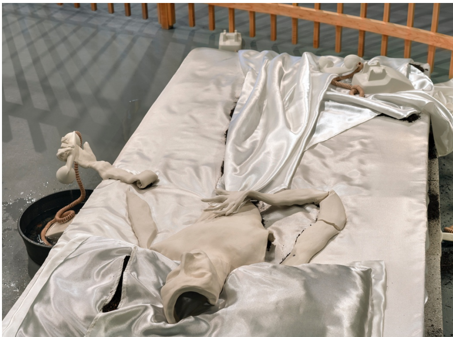
Recurring dream (detail),