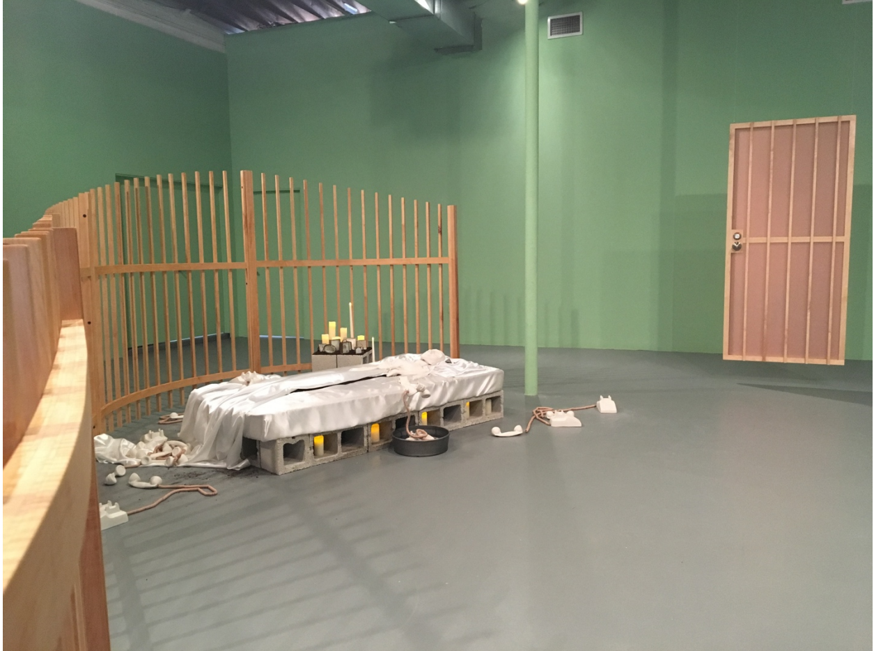
Cristine Brache: Cristine's Secret Garden Installation view at Locust Projects 2019

Additional images available upon request