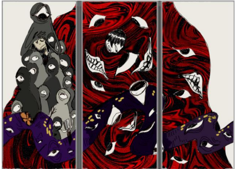
Detail from The Rebirth , a collaborative art installation by LAB teens on view along North Miami Avenue and 39th Street

LOCUST PROJECTS PRESENTS THE REBIRTH, AN 80-FT LONG PUBLIC ART PROJECT BY MIAMI TEENS PARTICIPATING IN THE 2020 ONLINE EDITION OF LOCUST ART BUILDERS