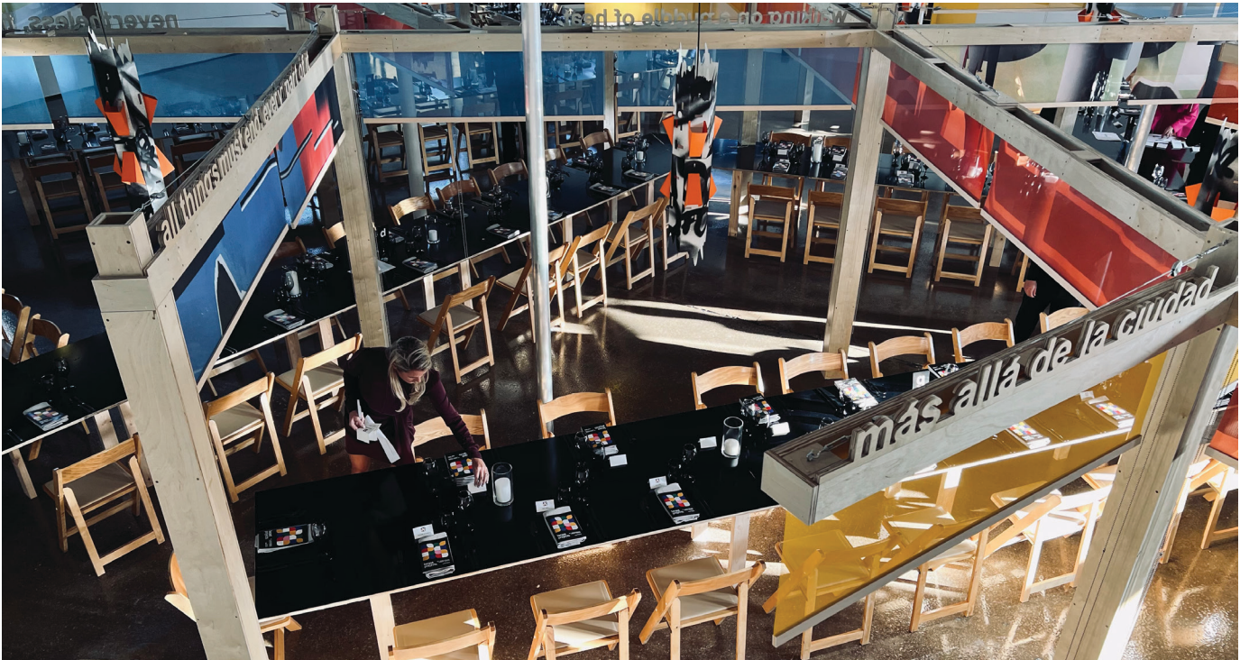
Rafael Domenech, assembling beneath a desire for sabotage , 2023. Chapter 4 || 25th Anniversary Benefit Dinner, photo by Locust Projects.